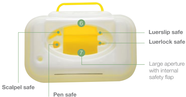
Sturdy handle on every model